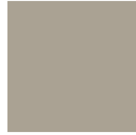
Canowindra $88/m3 (1)