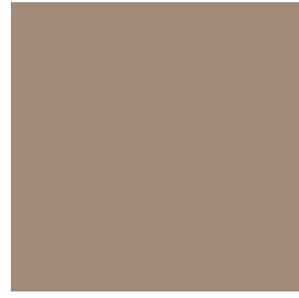
Towac $84/m3 (1)