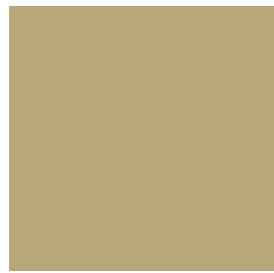
Ophir $86/m3 (1)