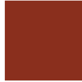
Fig $102/m3 (2)