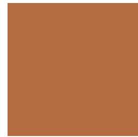
Windera $68/m3 (1)