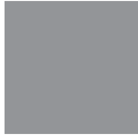
Pinnacle $110/m3 (1)